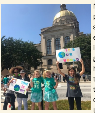
Young UUMANites at the State Capitol

gun violence after the Parkland shootings. (Nobody does anything alone ... ripples in a pond!)