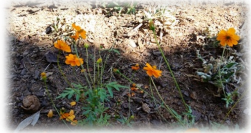
UFO—Unidentified Flowering Objects

UUMAN Gardening Group cbsullivan@bellsouth.net