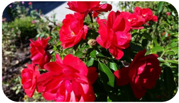
The Last Roses