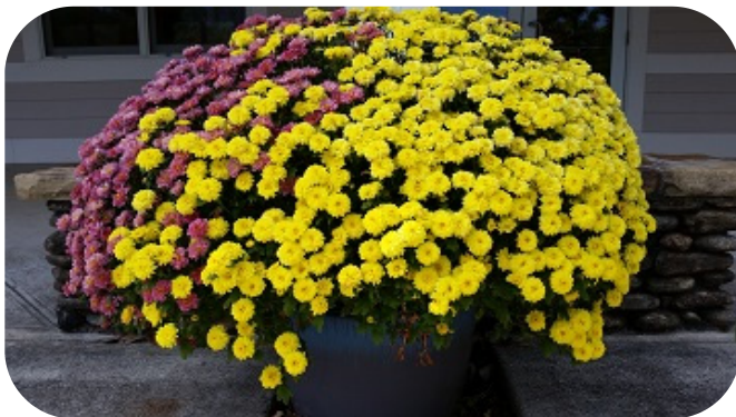
Some Potted Mums