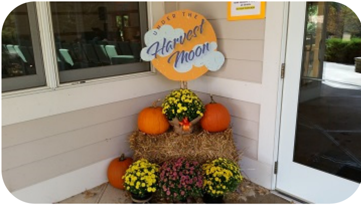
Our Harvest Moon Display

Claire Sullivan cbsullivan@bellsouth.net