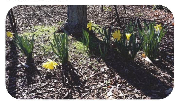
A Group of Daffodils

UUMAN Gardening Group cbsullivan@bellsouth.net