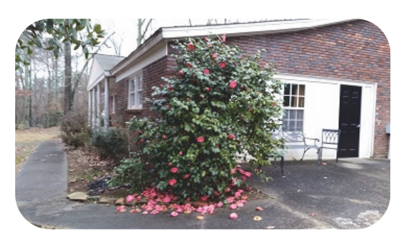
The Discovery Hall Camellia