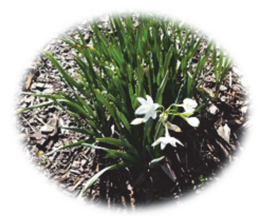
Narcissus—they just appeared this year