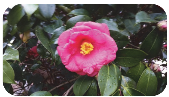
Close up of a Camellia