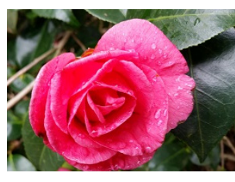
A Camellia Disguised as a Rose