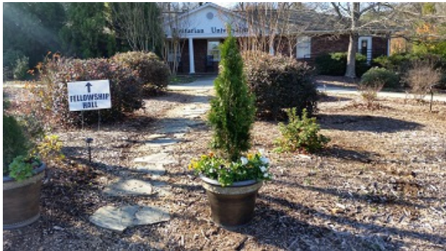
New planting in entryway