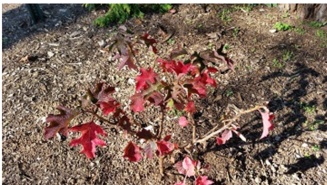
Newly planted Oakleaf Hydrangea