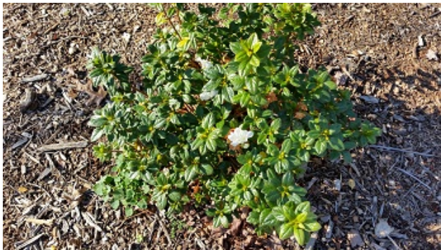
Azalea—still blooming in December