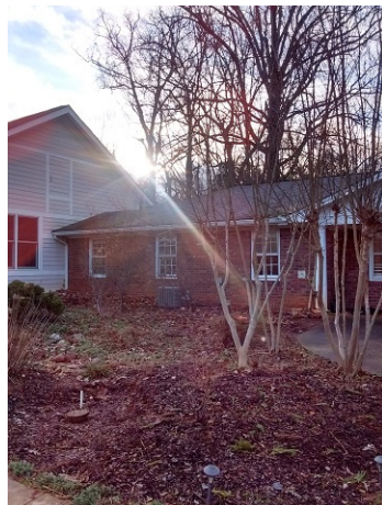
Where the Cryptomeria used to stand before breaking our water pipes January 2017