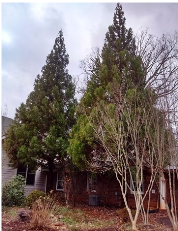
Cryptomeria that had to be removed due to breaking water pipes January 2017