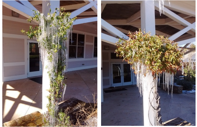
Carolina Jasmine after the ice storm